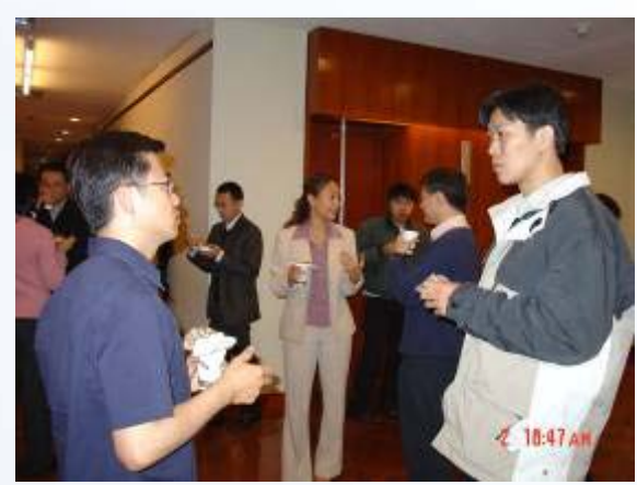
TWW 財聖法人台灣網路資訊中心 Taiwan Metwork Information Center