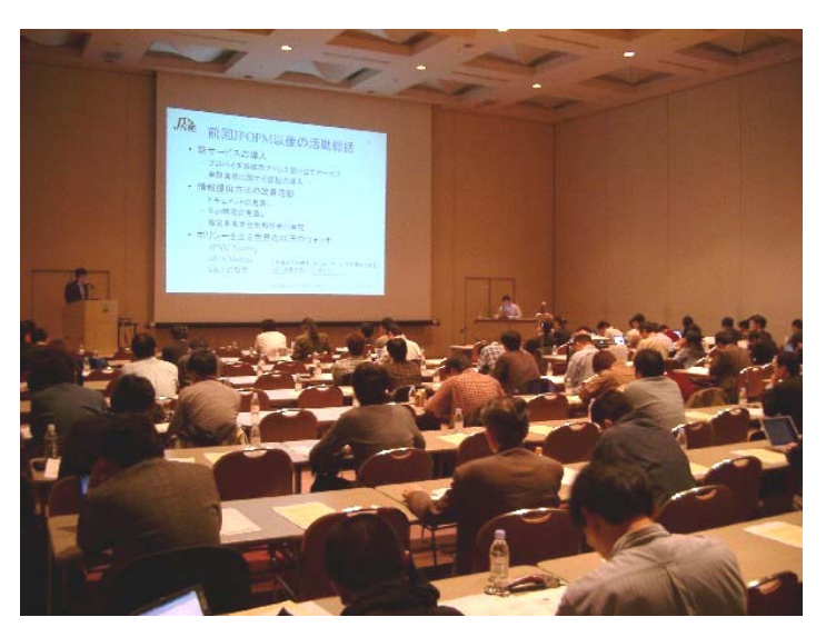
(Open Policy Meeting)