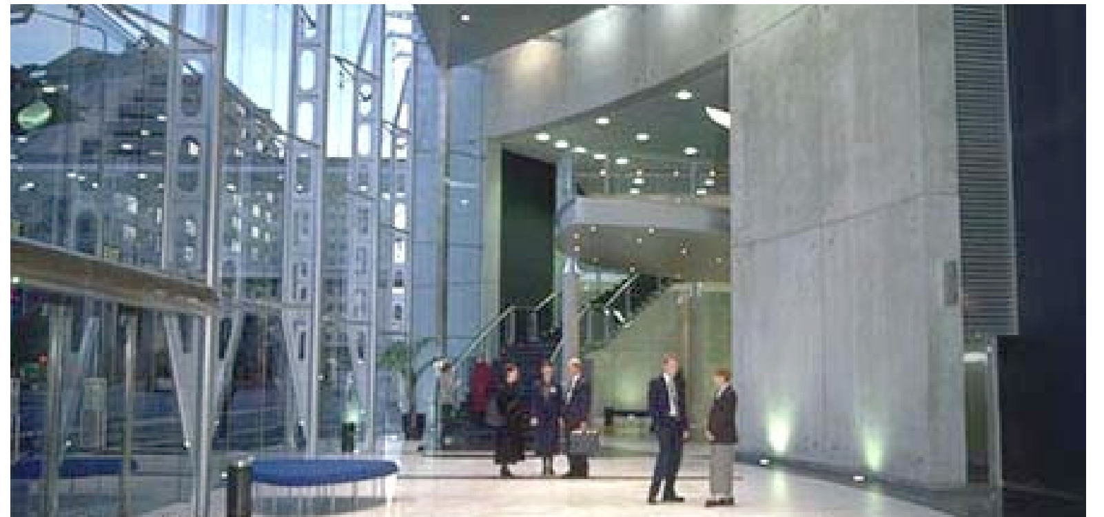
Christchurch Convention Centre Crowne Plaza Hotel