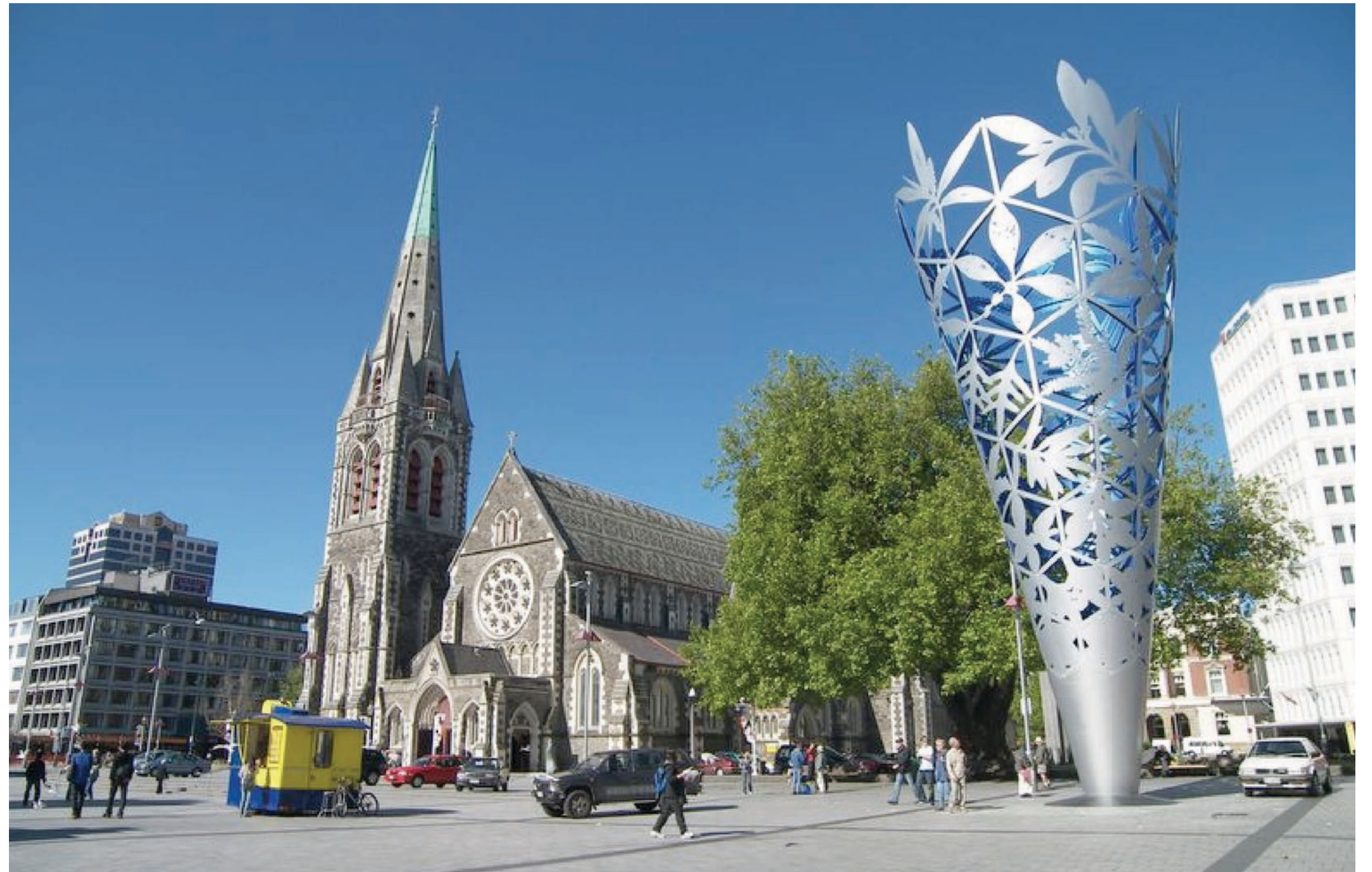
Christchurch, New Zealand